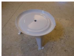
A (Stand and juice collecting bowl)