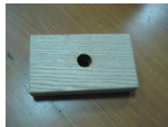
G (Wooden Plate)