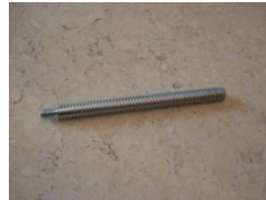
M (Centre Rod)