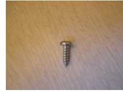
K (Stainless Steel Screw)