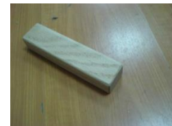
Hx2 (Wooden Cross Bar)