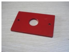
C (Pressure Plate)