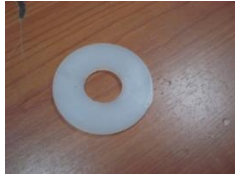
I (Plastic Ring Screw)