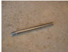
L (Centre Rod)