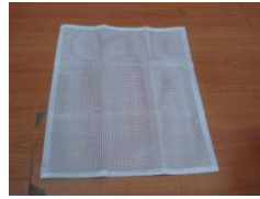
Jx3 (Juice Bag)