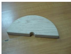
Fx2 (Wooden Plate)