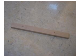
E (Pressing Cage)