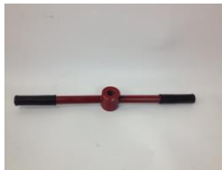
B (Press Handle)